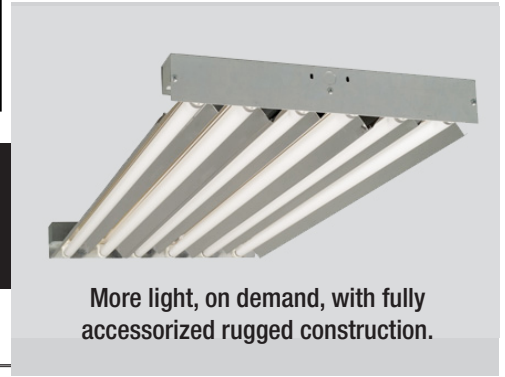
More light, on demand, with fully accessorized rugged construction.

NATURALLIGHTING.COM www.naturallighting.com 888.900.6830 email: sales@naturallighting.com